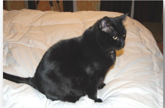
Before, October 2008